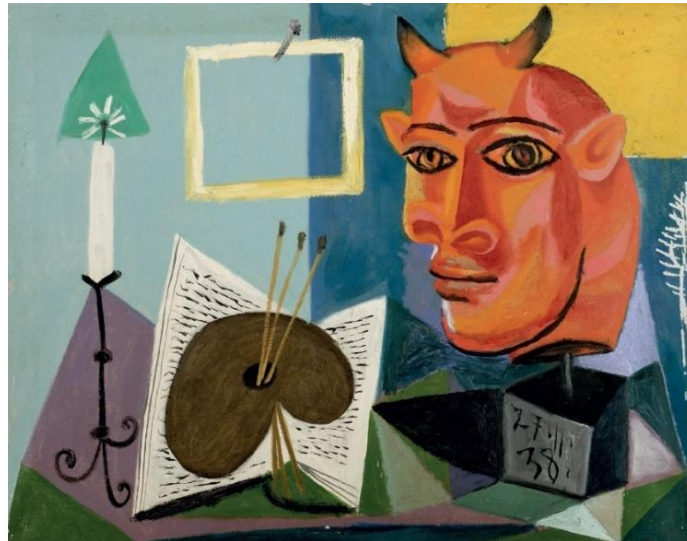
Picasso. Still Life with Minotaur and Palette.