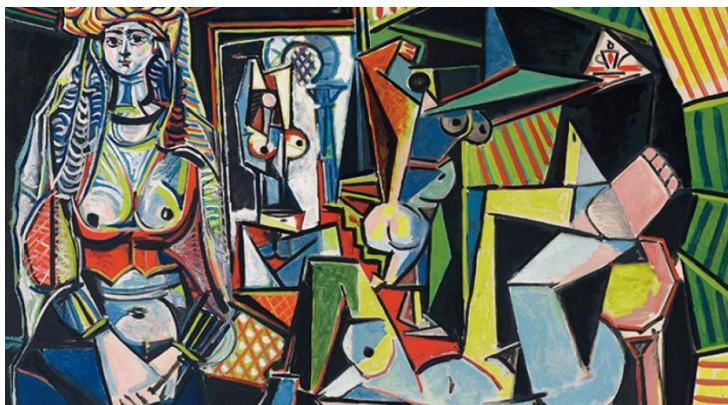
The Women of Algiers. 1955. Picasso Museum.