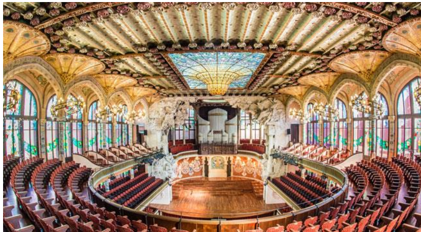
Palau de la Música Catalana - interior

Enjoying two secular buildings this morning, we will explore Gaudi's patron's home, Palau Guell, done with an unlimited and undisclosed budget, which is obvious when you see the riches inside. Palau de la Música Catalana by the wonderful architect Doménech y Muntaner celebrates Catalan song in its joyous decoration.