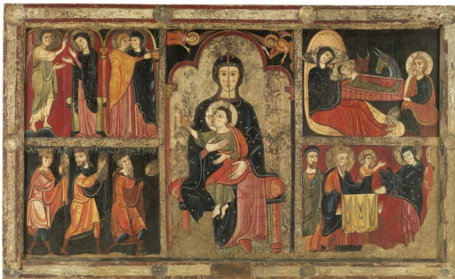
Romanesque Altar Frontal from St. Mary of Avia. 13 th Century. MNAC

The medieval County of Barcelona remained largely untouched by the Islamic kingdom of al-Andalus, and this is reflected in its distinctively Christian material culture. We will be focussing on the museum's remarkable collection of medieval Romanesque and Gothic art, as well as its plentiful Modernist painting and sculpture, though you will also have time to explore the renaissance and baroque collection.