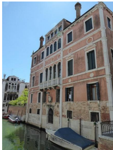
Palazzo Dona delle Rose

We will then walk to Zattere, have a coffee and take the vaporetto across to visit the magnificent Palladian church of Il Redentore. Afterwards, we will sit on the Redentore steps, reflect on Venice's long legacy into the 19 th century and try our hands at drawing some of the views favoured by Turner on his trips to the city. 2pm. Taking the vaporetto across to San Marco, we will get a view from the boat of the magnificent San Giorgio Maggiore. We then walk to the Fondamenta Nove (20 minutes), stopping for lunch around 3pm. 4.30pm-6.30pm. We will have either a private visit to the Palazzo Dona delle Rose, where we meet the owner to discuss the extraordinary history of her family of Doges and see her own private collection of art in the palazzo, or a visit to a fascinating contemporary art space for an unguided tour ( to be confirmed ).