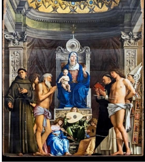
San Giobbe Altarpiece. Giovanni Bellini. c1480. Accademia Gallery.