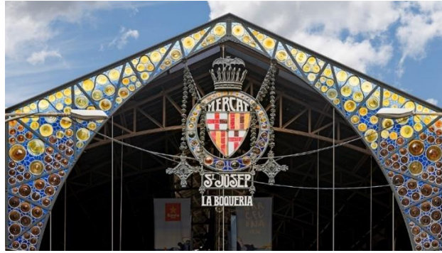
Entrance to the Boqueria Market