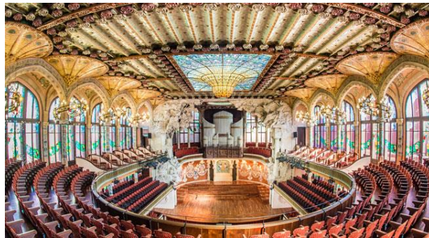
Palau de la Música Catalana - interior

Visit to Casa Batlló, Global Winner of the Tiqets World's Best Monument award, 2021. Here we can continue our journey with Gaudi.