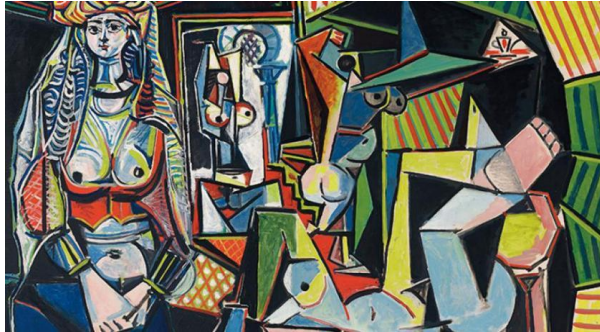
The Women of Algiers. 1955. Picasso Museum.

Picasso spent nine years in Barcelona, from 1895 to 1904, and the museum has one of the most complete permanent collections of his art, consisting of over 3,500 works, organised into three sections – painting and drawing, engravings, and ceramics. Housed in five adjoining medieval palaces, this beautiful space opened in 1963, while Picasso was still alive. We will discuss the visit after, in a quiet corner of the gallery.