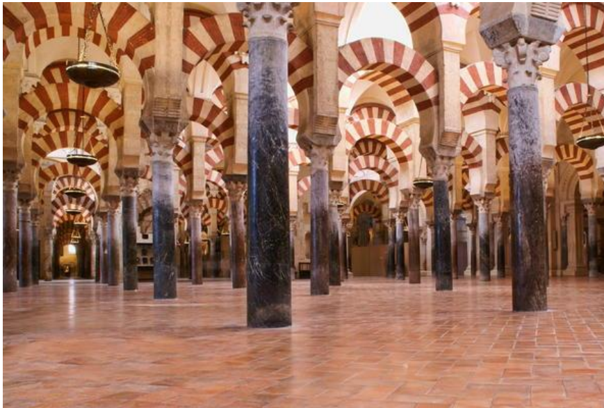
Cordoba Great Mosque – interior

This is a wonderful opportunity to see Andalucía, including Ronda, Córdoba and Málaga, on and off the beaten track. Tutors from Art & Culture Andalucía will provide guidance full of knowledge and enthusiasm. You need make no more decisions than you want to – we know just where to eat and how best to travel around. Join us for an uplifting short week at the beginning of summer.