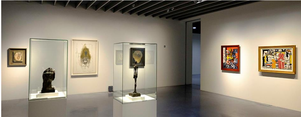
Centre Pompidou, Malaga