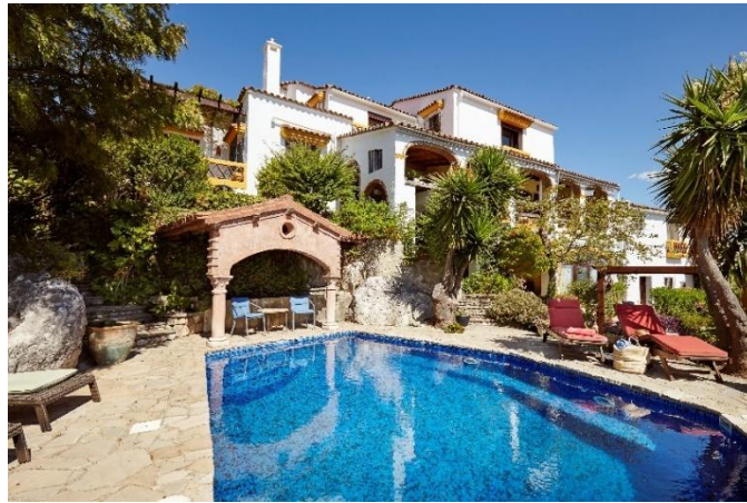
Luxury villa in Gaucin, pueblo blanco

In the pueblo blanco (white village) of Gaucin, in the Serrania de Ronda mountain range, we provide luxury villa accommodation for the first three nights of your exploration of Andalusian culture. The village is home to more than twenty international artists' studios – for reasons that will become obvious when you see the scenery and the light. The village and the villas offer stunning views down the Genal valley, all the way to Gibraltar, the Straits and the Rif mountains of Morocco. The climate in June is perfect, warm and sunny, but not yet the full heat of summer.