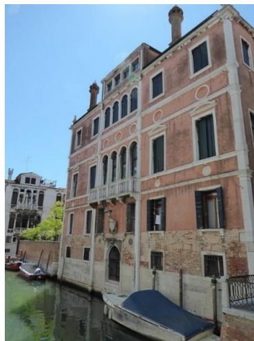
Palazzo Dona delle Rose

We will then take the vaporetto across to visit the magnificent Palladian churches of Il Redentore and San Giorgio Maggiore. Taking the vaporetto across to San Marco, we will then walk to the Fondamenta Nove (20 minutes) stopping for lunch en route. After lunch we have a private visit to the Palazzo Dona delle Rose, where we meet the owner to discuss the extraordinary history of her family of Doges and see her own private collection of art in the palazzo.