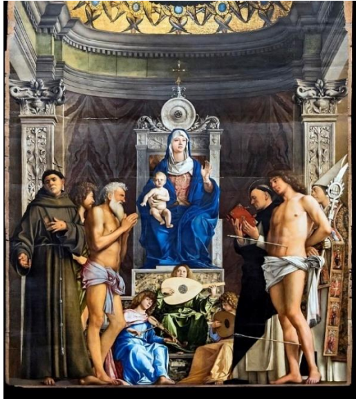
San Giobbe Altarpiece. Giovanni Bellini. c1480. Accademia Gallery.