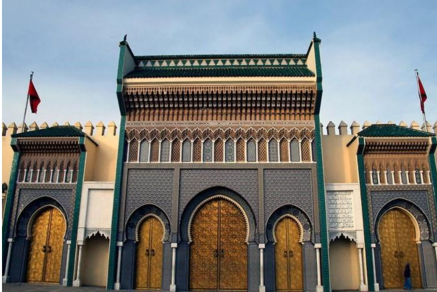
Dar-el-Makhzen, Kasbah, Tangiers.

Because of its strategically important location, Tangiers has a fascinating and varied history, beginning with its origins as a Phoenician trading post, through Carthaginian, Roman and Byzantine colonisation; native Berber involvement in the Islamic kingdom of Al-Andalus and its role as the eventual refuge for many of the Moors who were driven out of Spain following the Christian 'reconquest'.