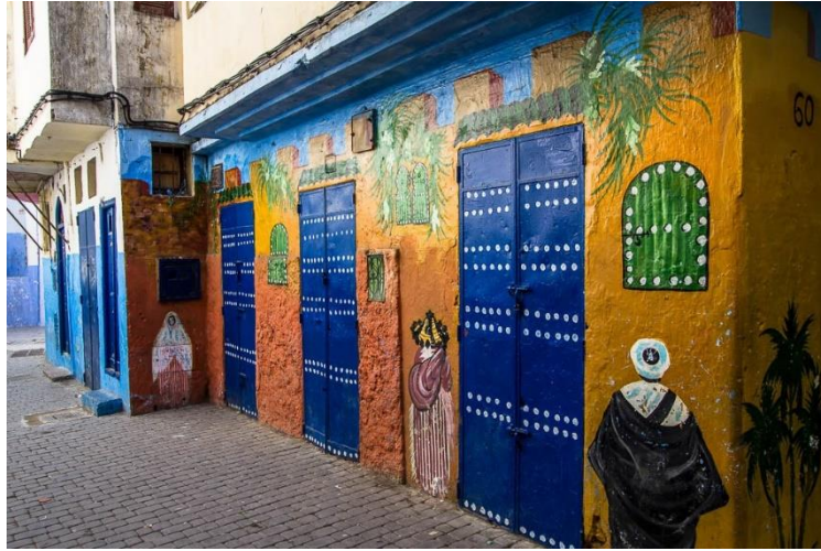
Street art in the Kasbah