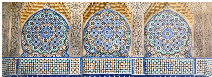
Mosaics in the Medina, Tangiers