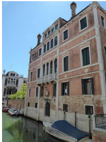
Palazzo Dona delle Rose

4pm-6pm. We have a private visit to the Palazzo Dona delle Rose, where we meet the owner to discuss the extraordinary history of her family of Doges and see her own private collection of art in the palazzo.