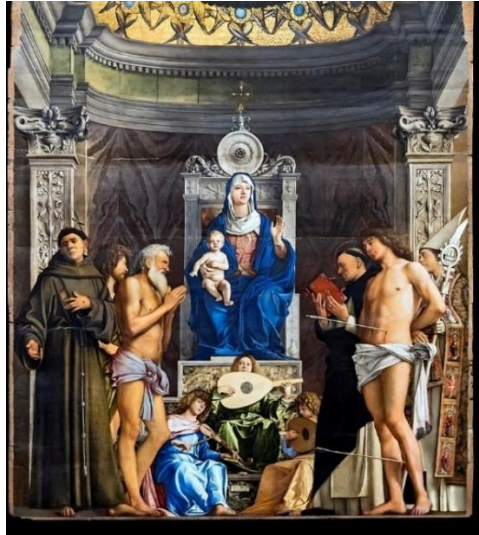
San Giobbe Altarpiece. Giovanni Bellini. c1480. Accademia Gallery.