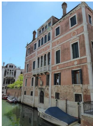
Palazzo Dona delle Rose

4pm-6pm. We have a private visit to the Palazzo Dona delle Rose, where we meet the owner to discuss the extraordinary history of her family of Doges and see her own private collection of art in the palazzo.