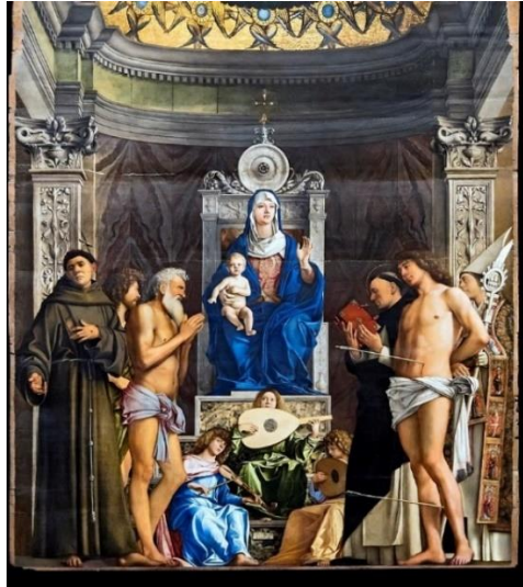
San Giobbe Altarpiece. Giovanni Bellini. c1480. Accademia Gallery.