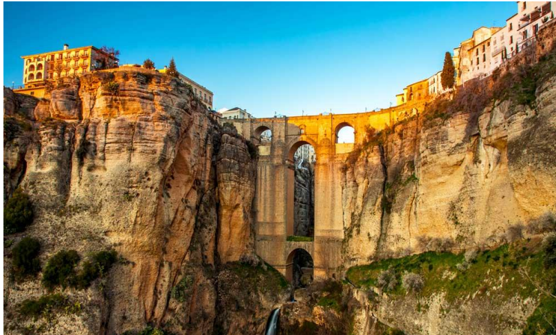
Ronda: the 'New' Bridge over the River Tajo

At 7pm we will meet for sunset drinks, following which we will enjoy a meal at a restaurant in the old medieval town.