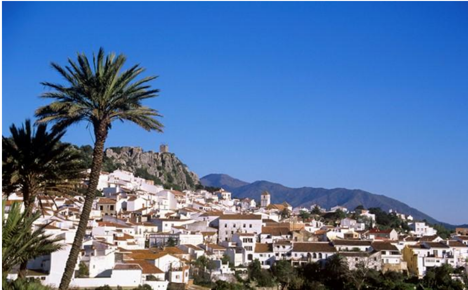
Gaucín Village, Serranía de Ronda

In the pueblo blanco (white village) of Gaucín, in the Serranía de Ronda, we provide gorgeous villa and hotel accommodation for the first two nights of your exploration of Andalucían culture. The village is home to more than twenty international artists' studios, and you arrive during Art Gaucin Open Studios. This is a once yearly celebration of all the artists of the village and one or two guest artists. The views of distant Gibraltar and the Straits, and of the Rif mountains in Morocco are spectacular. The climate in May is perfect, warm, and sunny, but not yet the full heat of summer. After two nights in Gaucin, the last three days are spent in Ronda, Córdoba and Málaga.