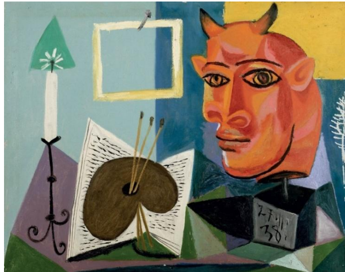
Picasso. Still Life with Minotaur and Palette.