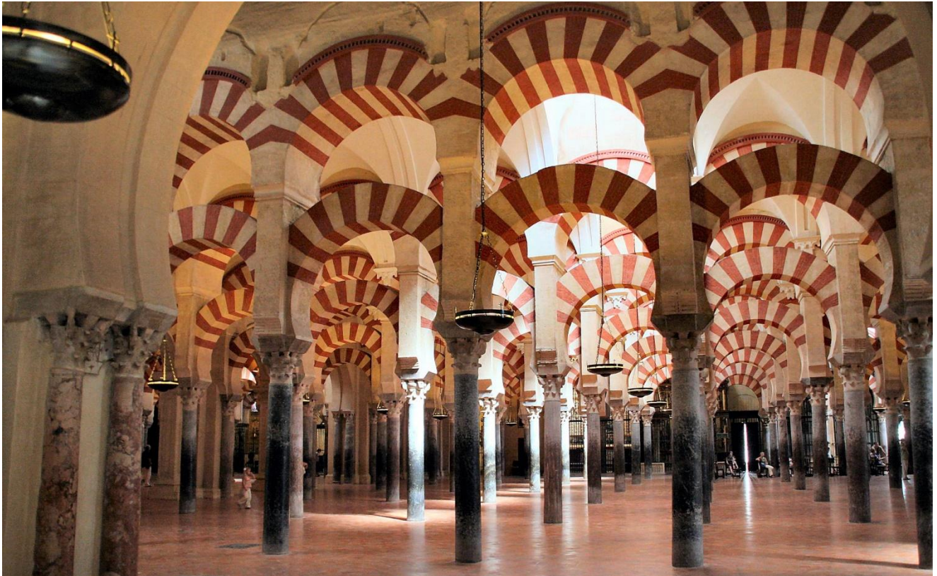
Córdoba Great Mosque interior

This is a wonderful opportunity to see Andalucía, including a typical 'white village' with the most outstanding mountain views and over twenty international artists' studios; spectacular Ronda, with its medieval quarter and famous bullring, stunning Córdoba, the medieval capital of Al-Andalus under the Umayyad emirs and caliphs; and the beautiful old town of Málaga, with its Roman and Islamic heritage, its restaurants and its remarkable variety of galleries and museums. Tutors from Art & Culture Andalucía will provide guidance full of knowledge and enthusiasm, as well as knowing where to eat and where to stay.